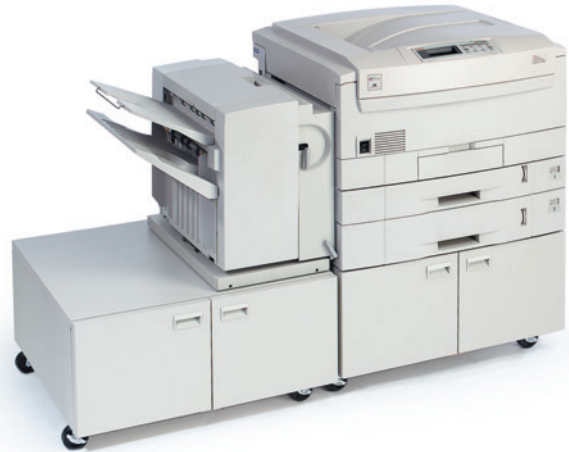
B. Base Model Printer with Optional Finisher and 2nd Tray plus: Two (2) Optional Printer/Finisher Cabinets