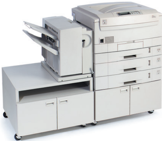
C. Base Model Printer with Optional Finisher and 2nd Tray plus: Optional 550-sheet 3rd Tray, Finisher Spacer (to match height of 3rd Tray), and two (2) Printer/Finisher Cabinets