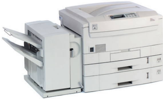
A. C9300/C9500 Series Color Printer with Optional Finisher: Basic Configuration (requires optional 550-sheet 2nd Tray)